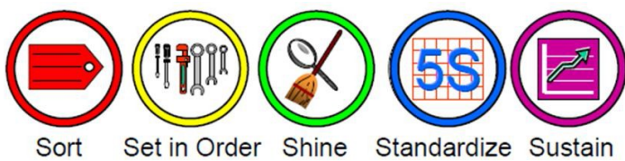
Sort Set in Order Shine Standardize Sustain